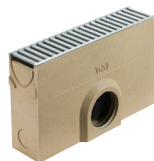
Sump unit with silt bucket