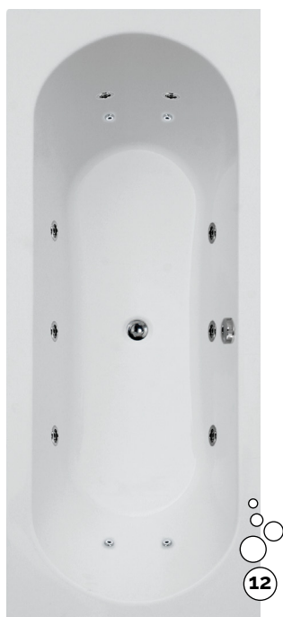
12 Jet System