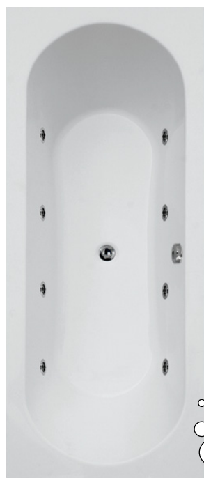
8 Jet System